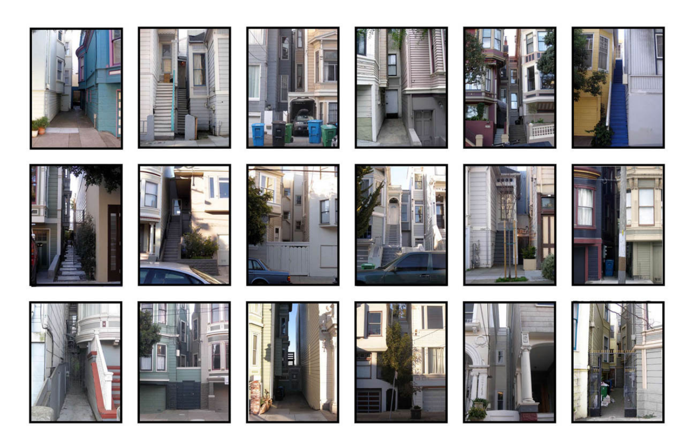
Figure 2: A wide range of slots found in the central part of San Francisco

architectural identity of the city was pegged to its historic residential districts, where the continuity of the street wall and the stylistic richness of its Victorian architecture were considered its characterdefining features.<sup>25</sup> There were several studies and surveys published in the 1960's and 1970's that were intently focused on the facade of Victorians, leading to a style-based body of knowledge related to Victorian residential architecture.<sup>26</sup> In sum, it can be argued, that these approaches unwittingly created a culture of recognizing the strikingly obvious features of architecture and urban design, thereby developing an arguably closed set of signifiers by which the city was identified and memorialized.