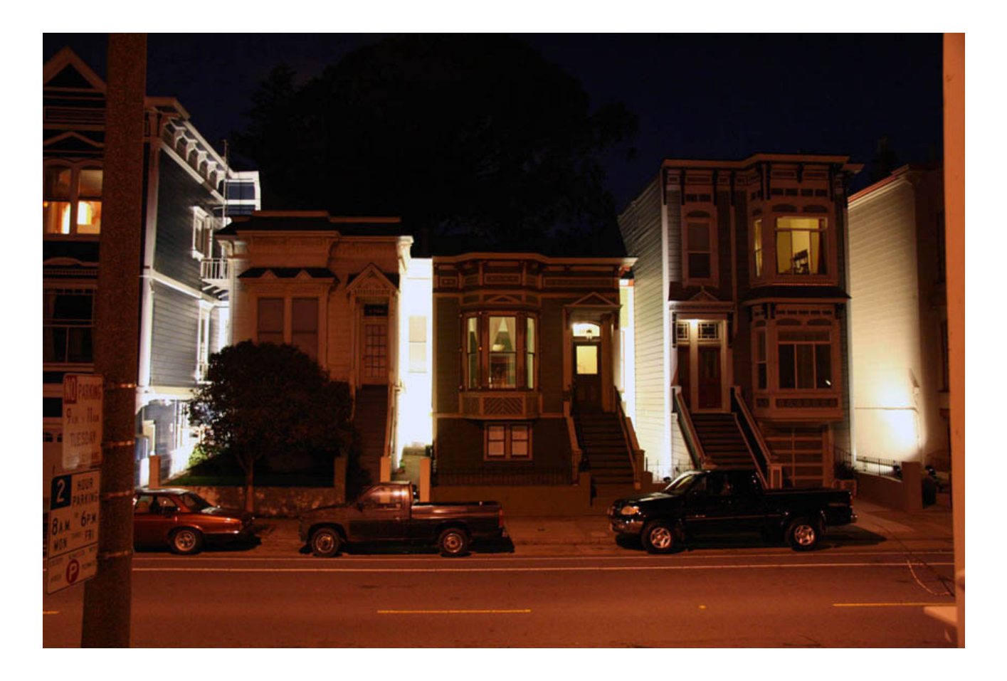
Figure 4: Interpreting slots – lighting. Golden Gate Avenue, San Francisco (author and Elaine Buckholtz)

In order to explore, and unravel this question, particularly the idea of "recontextualization," I first turn to avant-garde research in the artistic domain as a methodological inspiration for the examination and interpretation of slots.