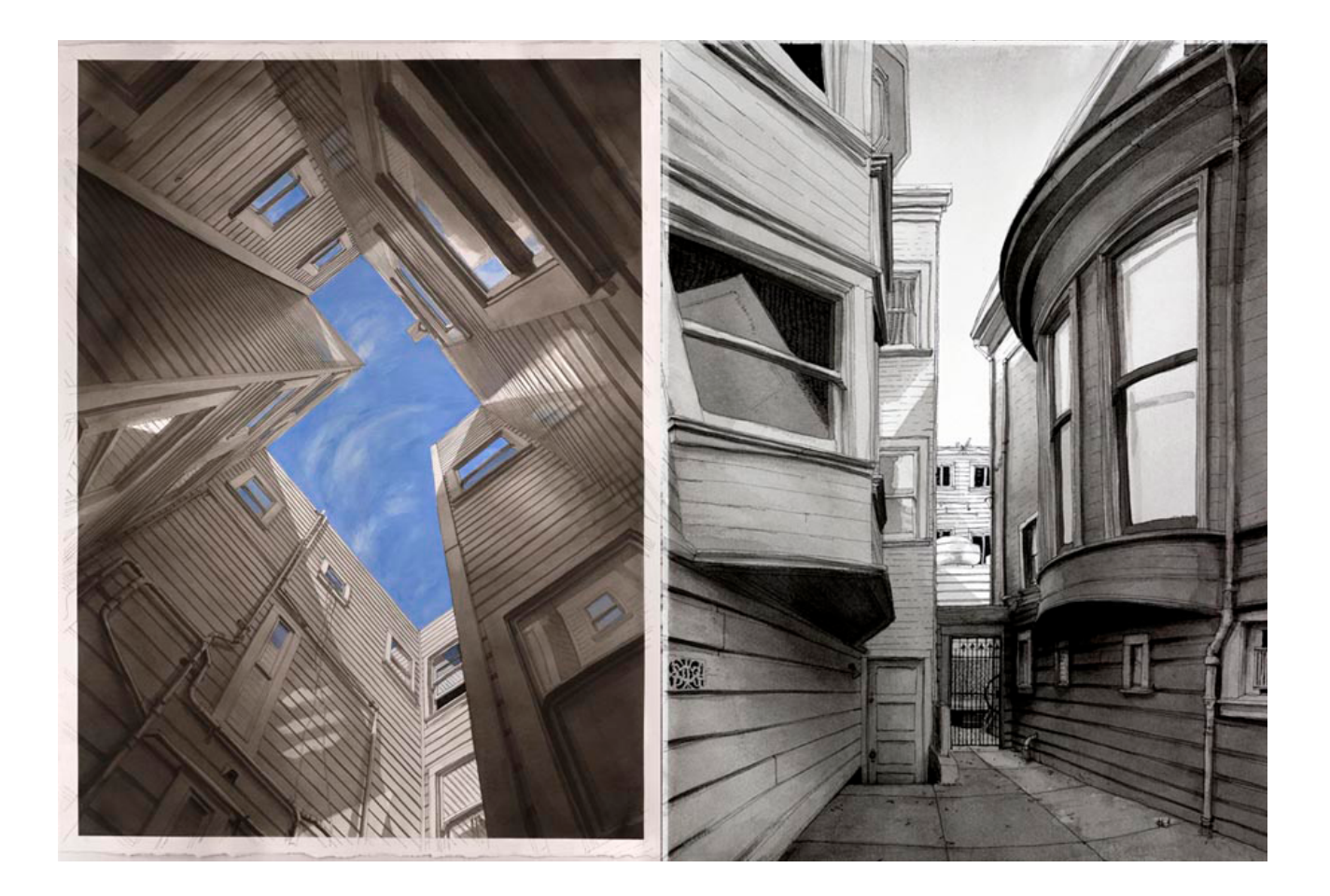
Figure 1: Slots in San Francisco (drawings by Paul Madonna)

the identity and memory of San Francisco's architecture and urban form, and the rich potential that their interpretive representations provide in developing new perspectives in architectural and urban design. Such an investigation, I hope to demonstrate, opens up the possibility of an architectural identity that is not limited to neo-traditionalist (historic/nostalgic) or neo-modernist (technological/ futuristic) oppositions, or the depiction of the city as picturesque tableaux (scenographic). Instead, unraveling and interpreting the city's hidden spaces points to alternative narratives—alluding to what a future architecture might look like—where a city's past and present and projected into the future.